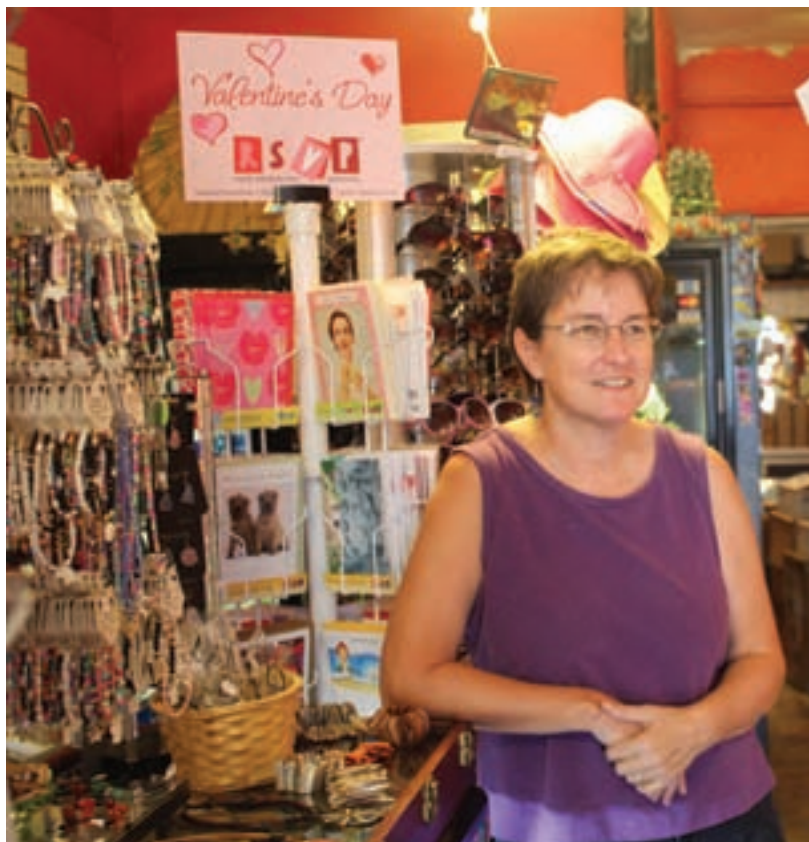
Denise of Vieques Flowers & Gifts